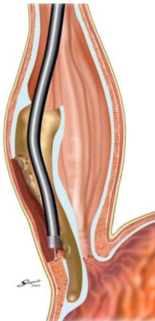
Figure 4. Muscle layer cutting-continued for at least 2 cm distal to the GEJ.